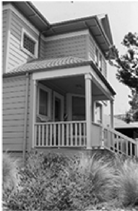
100 YEARS YOUNG AND BEAUTIFUL AT 1101 ALMA